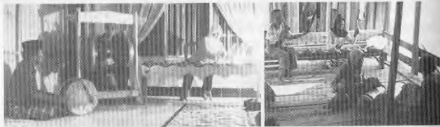
Kailinese Kakula Ensemble