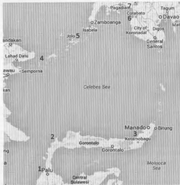
Figure 1. General Geographical Location of Considered Communities. 1 - Kaili, 2 - Tolitoli, 3 - Bolaang Mongondow, 4 - Sama Bihing, Sama Dilaut (Tawitawi), 5 - Tausug, 6 - Maguindanao, 7 - Maranao