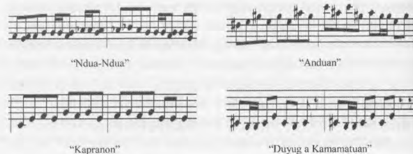
Figure 6. Transcription of the opening phrases of the Kaili “Ndua-Ndua”, Tolitoli “Ndua-Ndua”, Maranao “Kapranon”, and Maguindanao “Duyug a Kamamatuan” in staff notation.

This melodic duality found both among the Kaili and Tolitoli repertoires is also present in the Southern Philippines. The transcriptions below include the first eight beats of both Kaili “Ndua-Ndua” and Tolitoli “Anduan” as well as the Maranao piece “Kapranon” used for the kapagapir dance in the region and the Maguindanao “Duyug” in the kamamatuan style (this phrasal duality is also present in “Sinulog” in the kamamatuan style among others). The examples below are transcriptions of the first phrase, which is later repeated in some cases with slight variations.