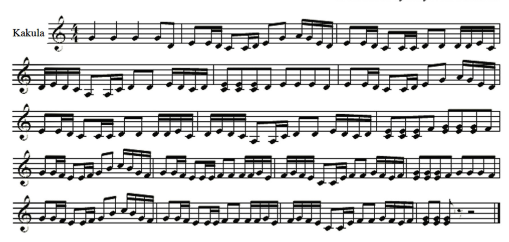
Figure 12 "Peulu Cinde" transcription

Composer and choreographer Hasan Bahasyuan left a significant legacy of works for Central Sulawesi. Developing and establishing forms and styles for the genre of kreasi baru in the region, his compositions served as influential material towards the development of new works by other new groups in Central Sulawesi. After his death and the end of the orde baru period in 1998, groups began to look for new compositional influences utilising new presentational approaches. The era reformasi (reformation era) in 1998, sprouted a national decentralisation process that included the performing arts, especially those outside of Java and Bali. In Central Sulawesi, groups with foundations on the kreasi baru legacy looked for new approaches to staging identity and representing the province when performing abroad. Ensamble Modero Palu, one of the most prominent groups during the era reformasi , acts as a representative pillar of performances from this current era in Central Sulawesi.