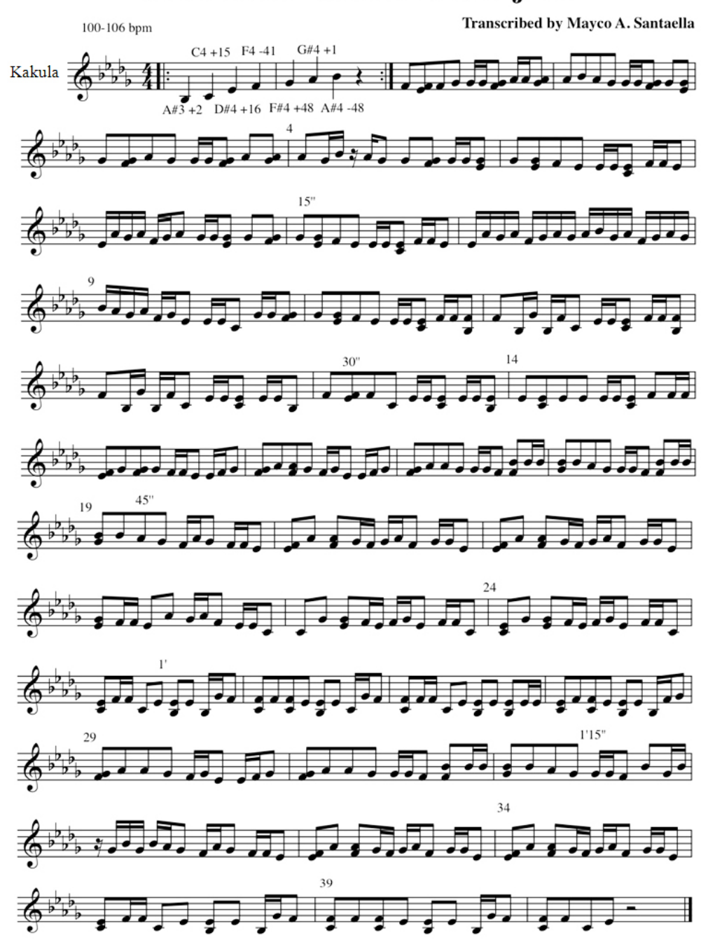
Figure 8 Kakula